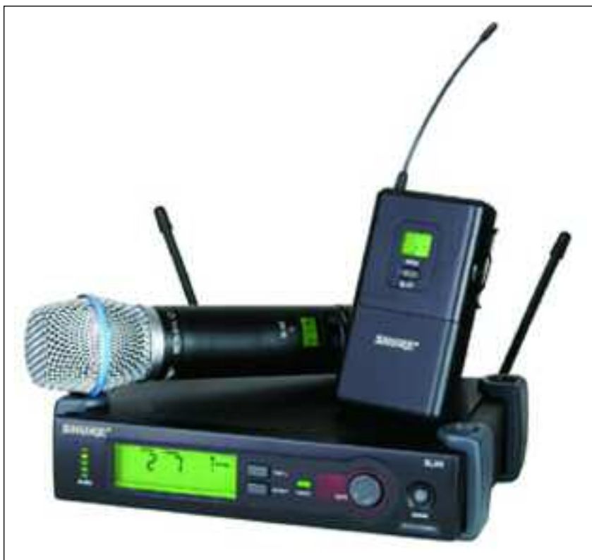
The new SLX wireless system from Shure, with bodypack and handheld transmitter options.

Three SLX frequency bands were chosen by examining UHF TV channel allocations in the top 50 U.S. television markets. Because UHF wireless