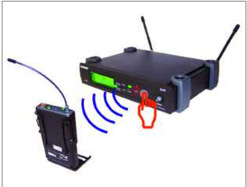
Figure 2: A couple of button pushes and the system is programmed.

This scheme allows for at least five compatible systems within a given